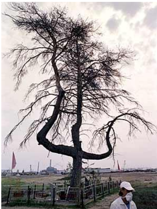
The pine tree on the left.

http://www.interfax-religion.com/?act=news&div=8394